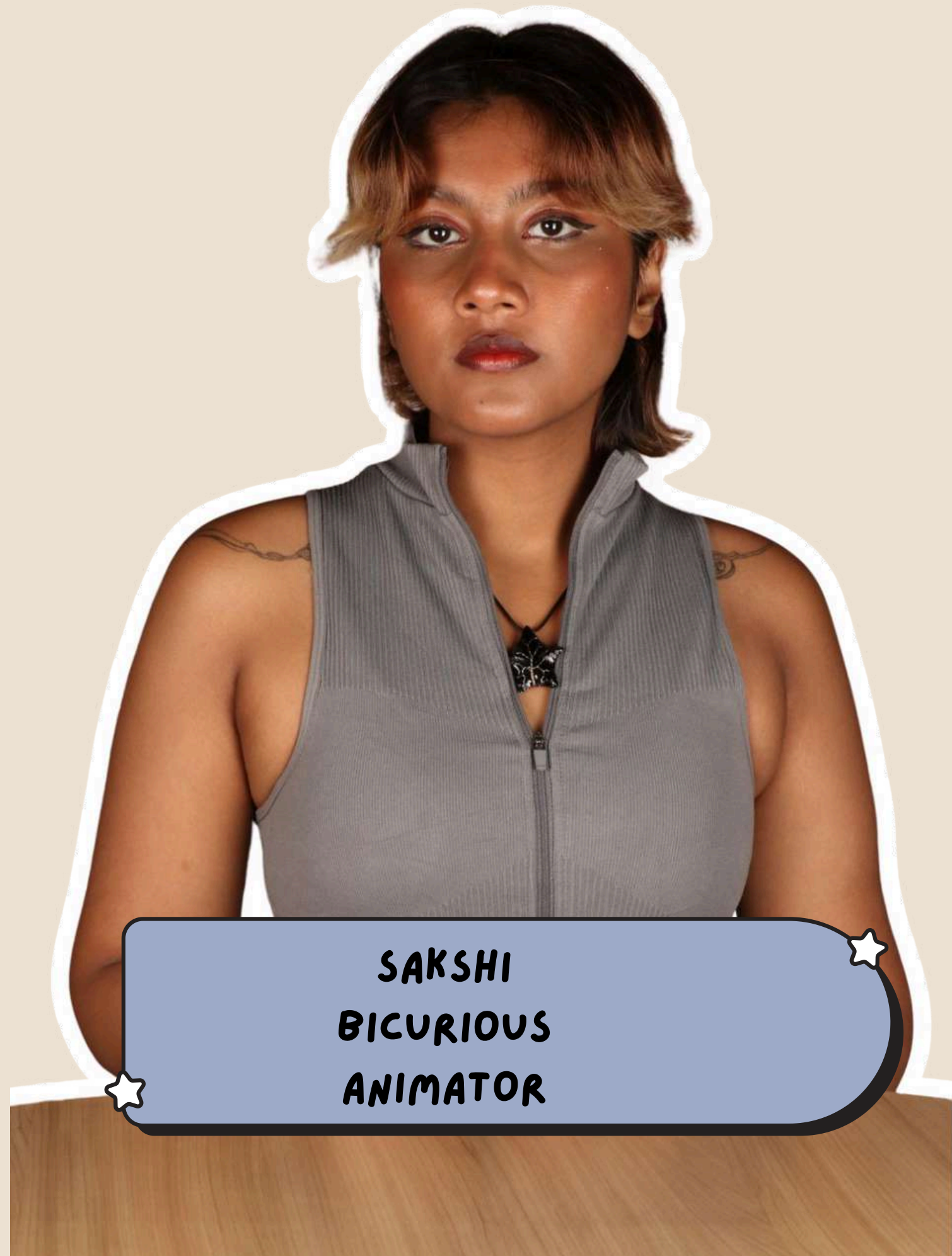
SAKSHI BICURIOUS ANIMATOR